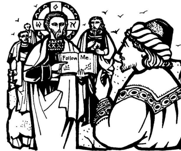
Matthew 19: 16-26

12 th Sunday after Pentecost September 4 th , 2011