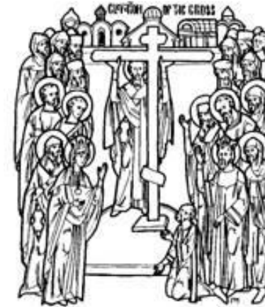
The Exaltation of the Holy Cross